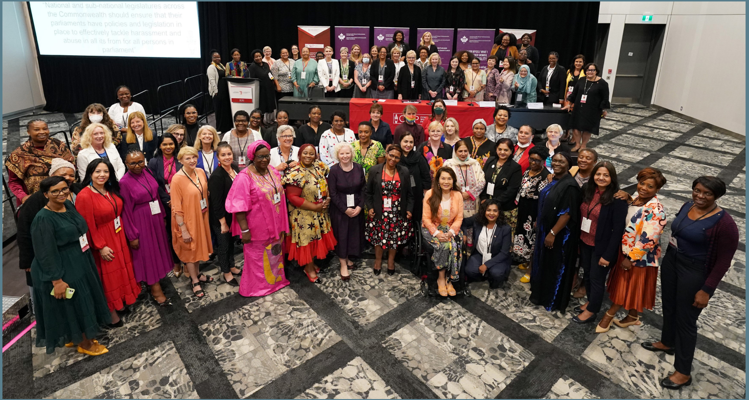
CWP Membership at the Triennial Conference of Commonwealth Women Parliamentarians in Halifax, Nova Scotia 2022.