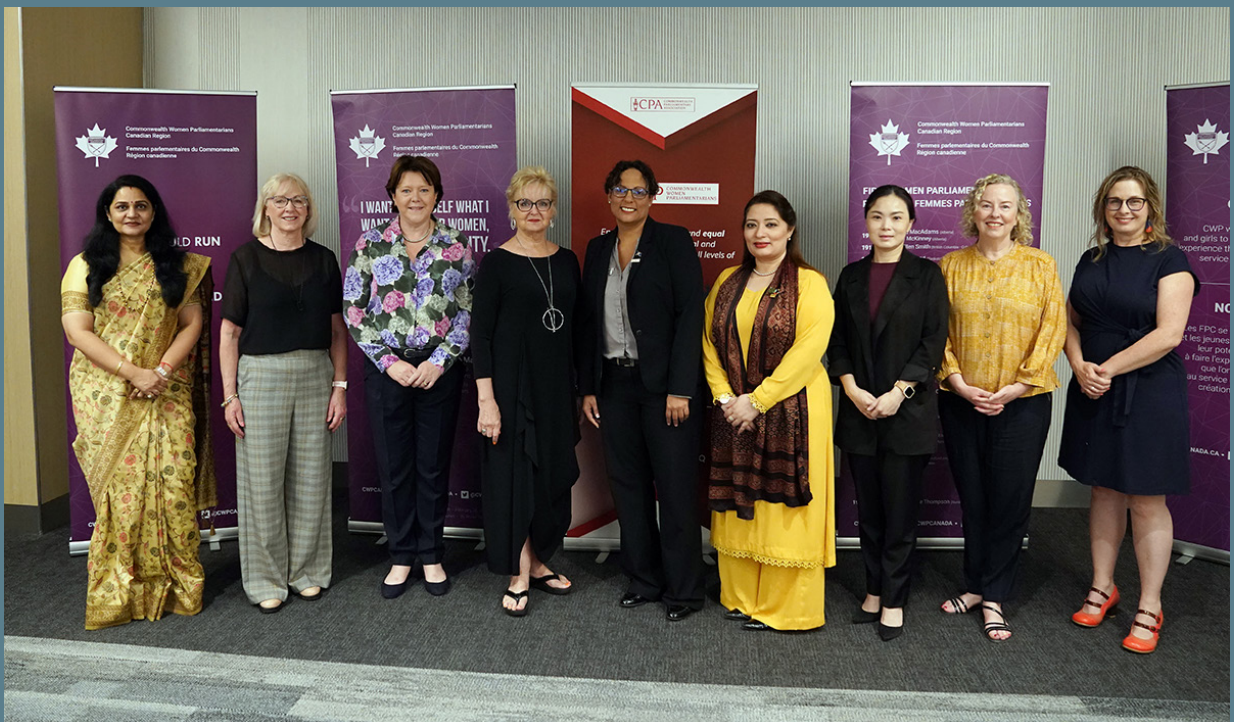
Members of the Commonwealth Women Parliamentarians International Steering Committee