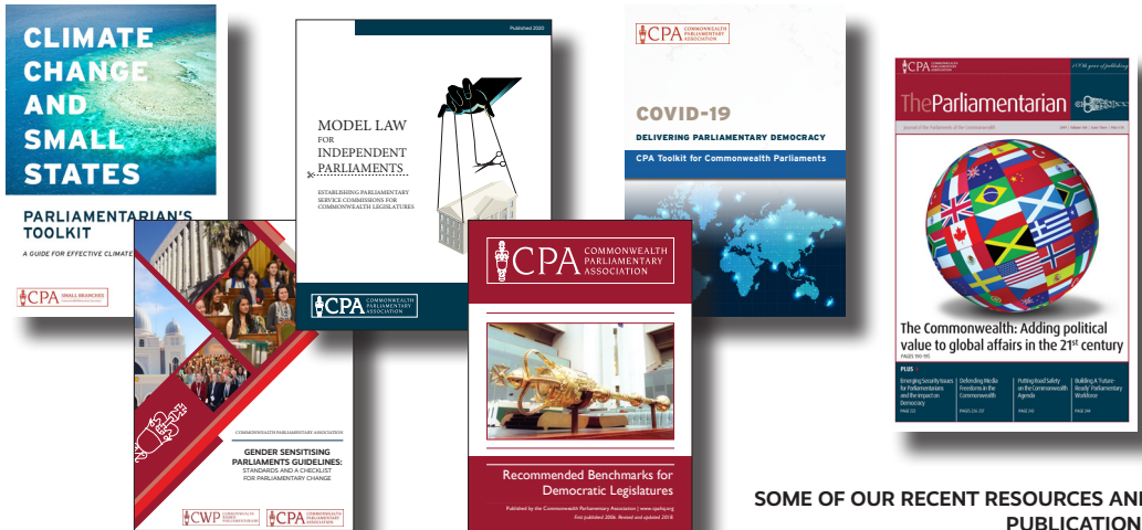
SOME OF OUR RECENT RESOURCES AND PUBLICATIONS

The CPA works with a wide range of organisations to deliver programmes which strengthen Commonwealth parliaments, supports and promotes parliamentary democracy in accordance to the Commonwealth Charter and which aligns with the Sustainable Development Goals. Some of our recent partners include: inter-governmental organisations; regional organisations; academic institutions; non-governmental organisations; professional training bodies; private businesses; think tanks and other research bodies.